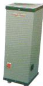
TRI-STATE MEDICAL COMPACT UV STERILIZER