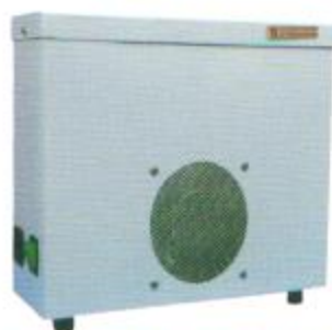
TRI-STATE MEDICAL DEO-UV STERILIZER